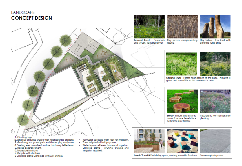
Fig. 10: Landscapng

6.36 On the upper levels the landscaping approach to the communal areas has developed well, with encouraging introduction of green roof areas to provide improved drainage strategies, timber play features, movable furniture socialising areas, low maintenance planting. The overall level of external playspace has yet to finalised but based on a policy compliant scheme of 50% affordable housing the level of amenity space would appear appropriate.