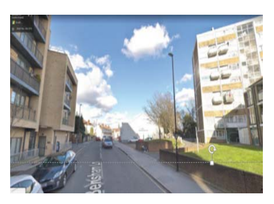
Fig. 2: Application Site (Left) and View from London Road with site in centre (right)