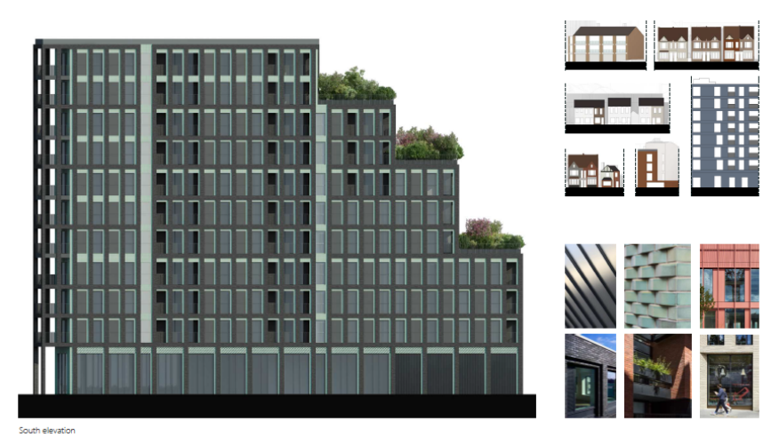
Fig. 9: Materiality along south elevation

Ground Floor Activation, Legibility, transparency