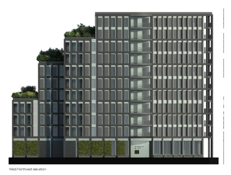
Fig. 8: Proposed materiality along west/north elevation