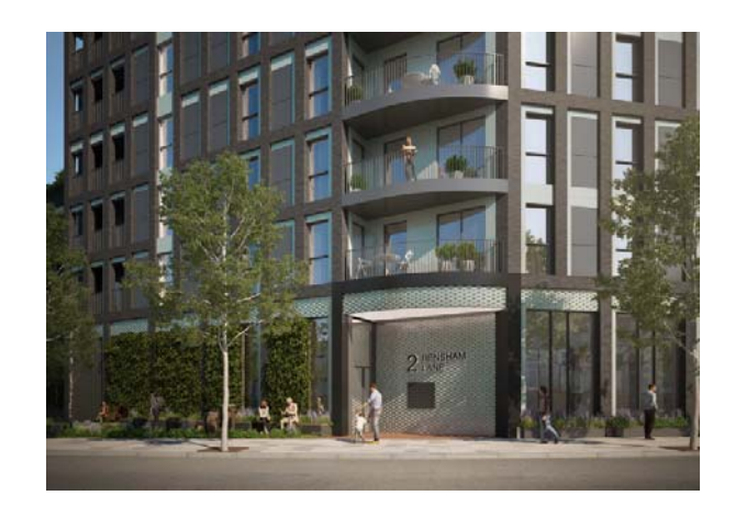
Fig. 5: Image of residential access point along Bensham Lane