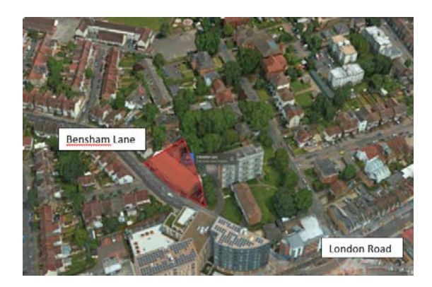
Fig. 1: Site Location shown in red (Left) and Google Map (right)