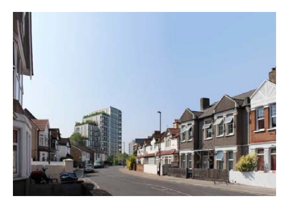
Fig. 3: View of proposal from London Road (left), view from Bensham Lane (right)

4.11 At the southern tip of the site the proposal would provide the entrance to the commercial ground floor unit accessed across a landscape approach including visitor cycle rack external seating and planters. This directly faces towards London Road. Access to the residential flats would be from recessed lighted covered entrance point facing directly off Bensham Lane.